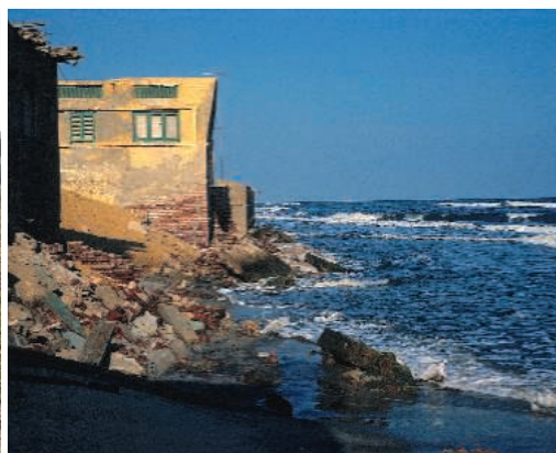
The cost of control. Now that the Nile no longer floods the delta, pollution in connected canals (left) and coastal erosion (right) are growing problems.

The scientific consensus is that the Mediterranean will indeed rise as part of a global increase in sea levels, but how far and how fast is another matter. "What we do know is that the temperature of the ocean is increasing," says El-Baz, and water expands as it warms. "So this part is easy to predict." More worrying to climate scientists than this thermal expansion is whether global warming will trigger the ice on top of Greenland and Antarctica to break up and slip into the water. That is why forecasts for sea-level rise by the end of this century have ranged between 0.2 and 2 meters ( Science , 5 September 2008, p. 1340). The former would be a manageable nuisance for the delta, whereas the latter would be catastrophic, all agree.